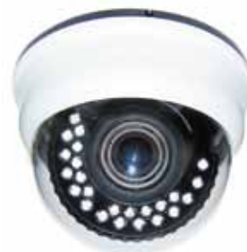
Vari Focal Lens